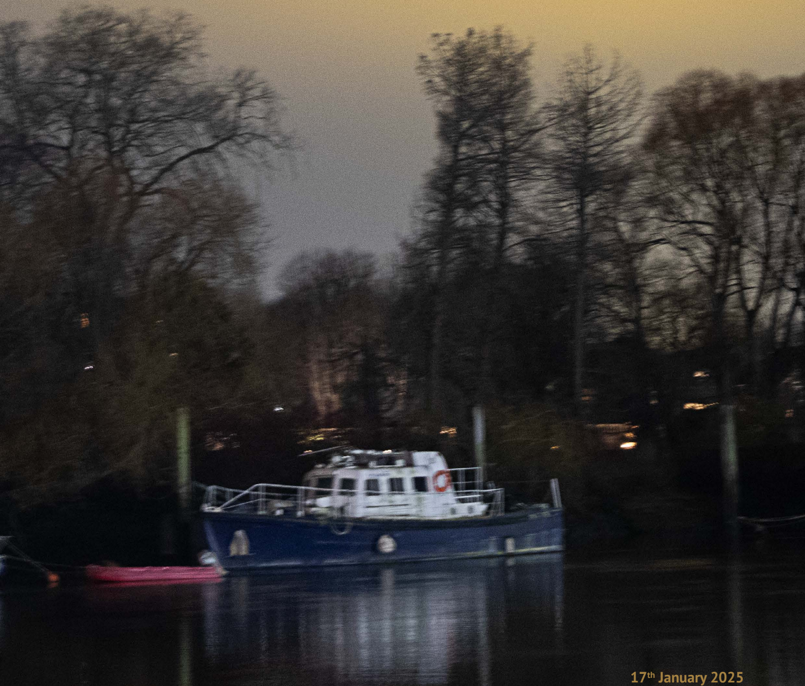
Twickenham Stadium glow at night